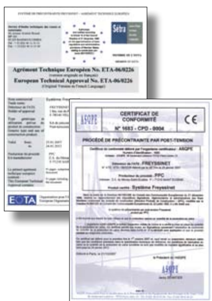
ETAG 013 - "European Technical Approval" and the associated "CE Declaration of Conformity"

Freyssinet is the holder of the ETA n°06/0226, covering the application under cryogenic conditions, and of the CE marking certificate n°1683 - CPD-0004.